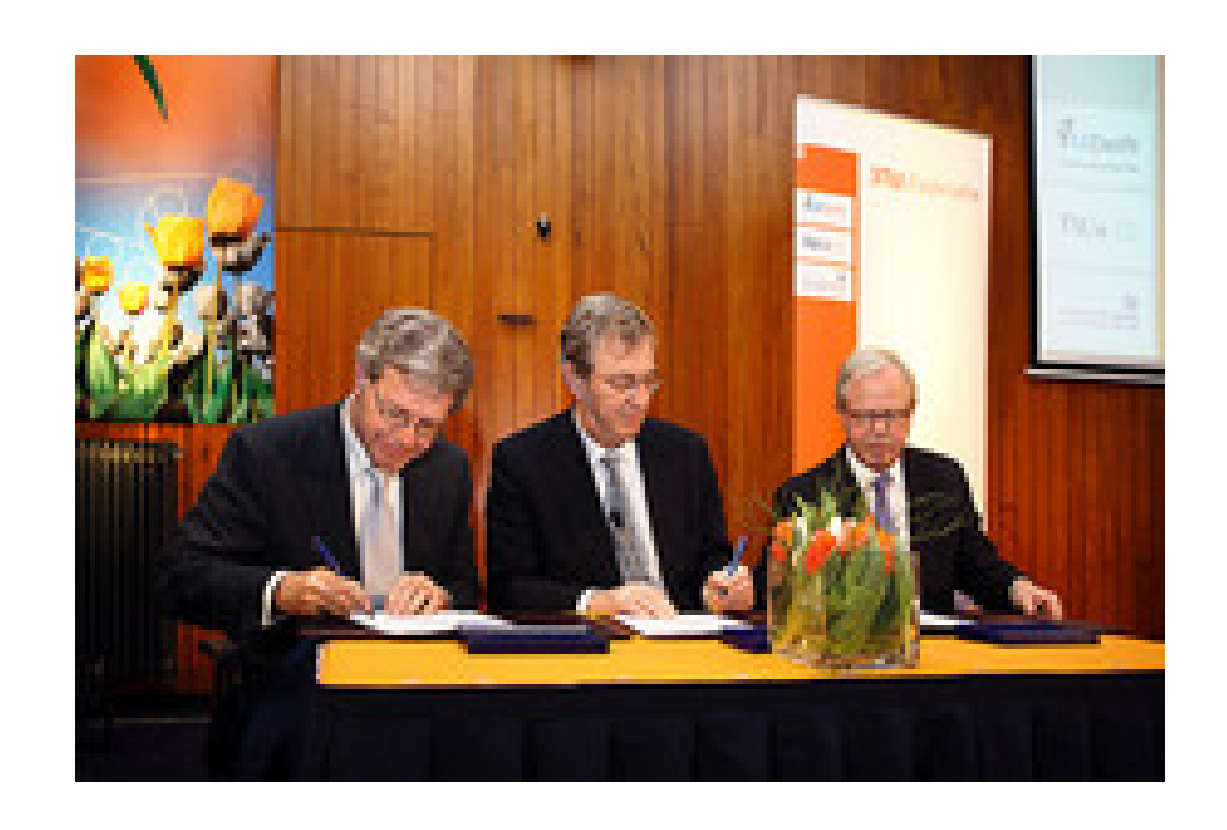
7 Februari 2007